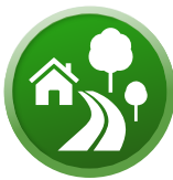
Local Streets and Roads

Continues delivery of the remaining 2009 Measure A projects while providing the funding framework identified in the Riverside County Transportation Improvement Plan to guide future transportation investments in Riverside County across three categories: