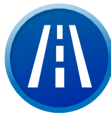
Highways and Regional Corridors