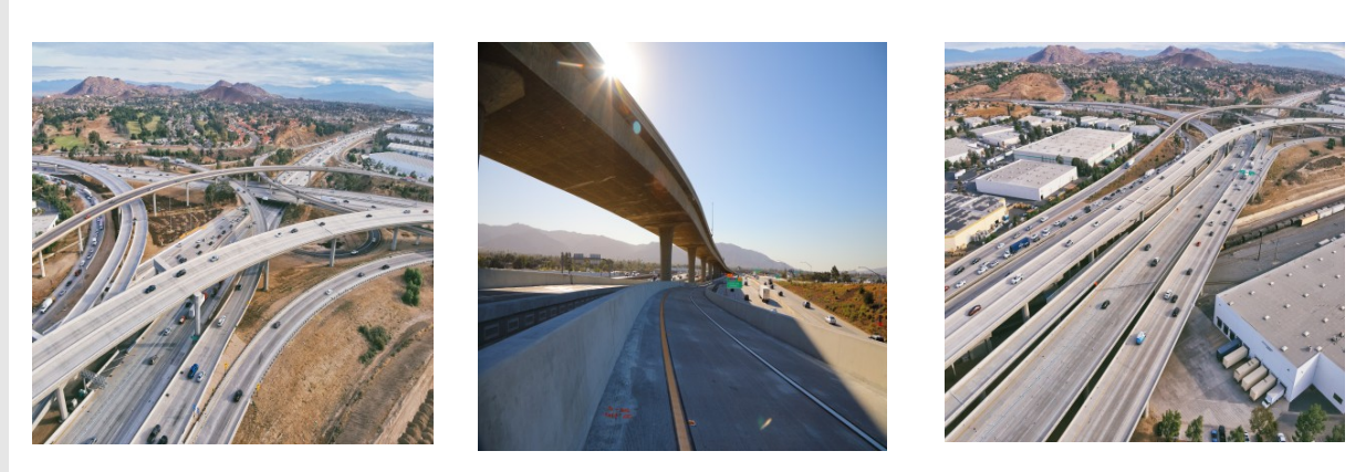
Please note that construction activity is subject to change.