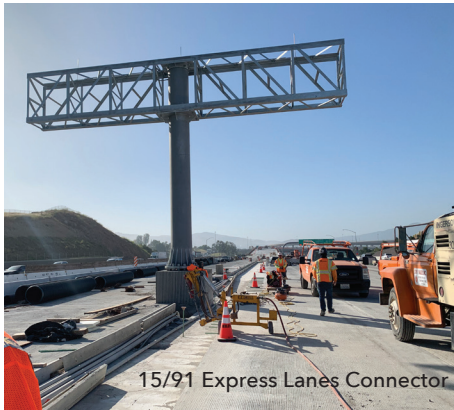
15/91 Express Lanes Connector