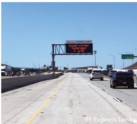
91 Express Lanes