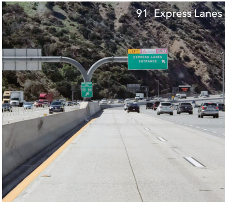
91 Express Lanes