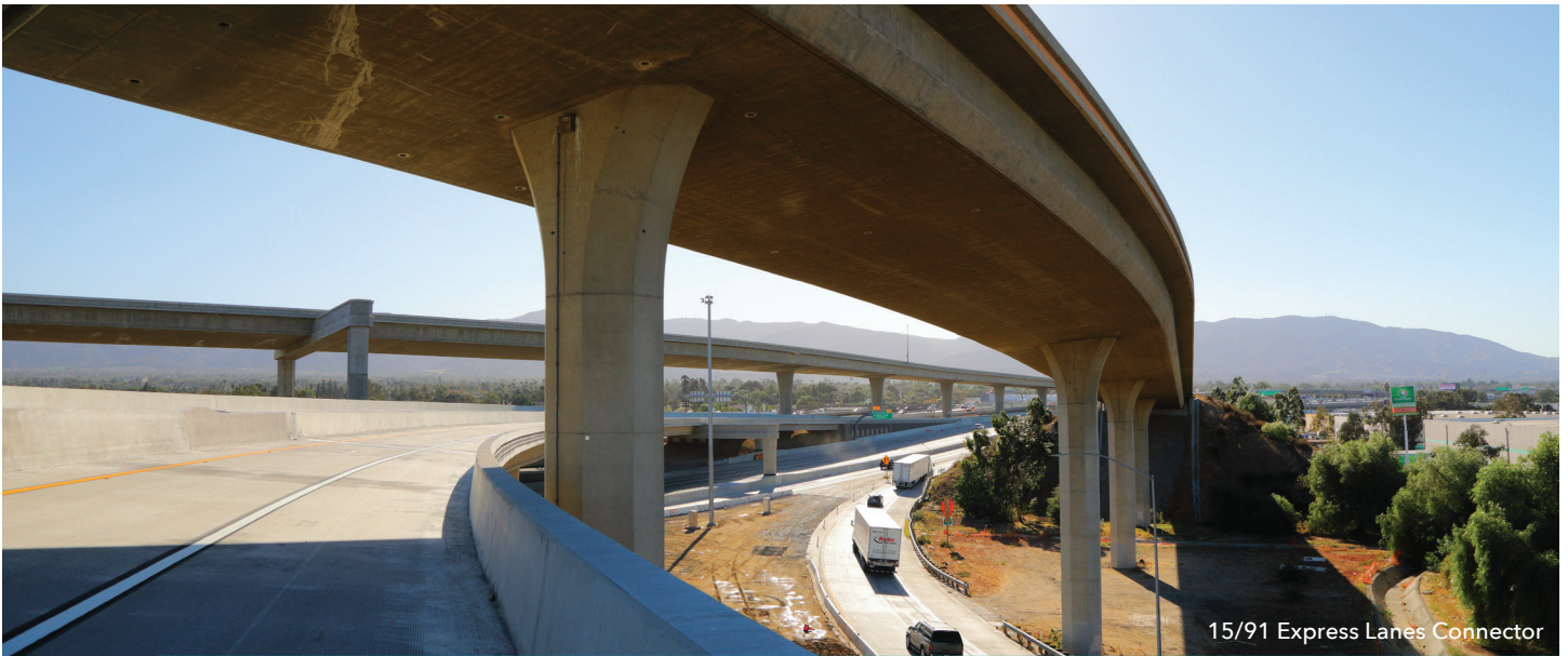
15/91 Express Lanes Connector