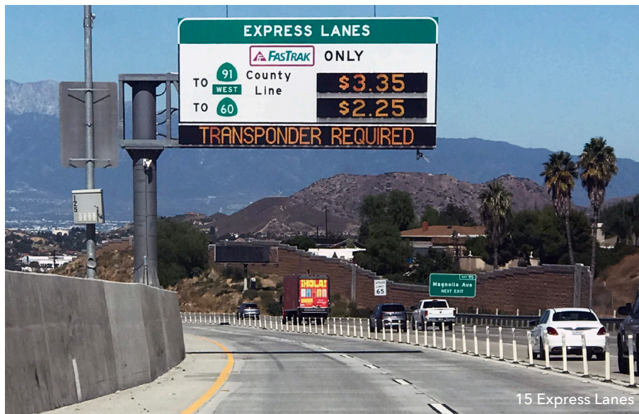
15 Express Lanes

Fair Value Hierarchy: The Commission categorizes its fair value measurements within the fair value hierarchy established by generally accepted accounting principles. The hierarchy is based on the valuation inputs used to measure fair value of the assets. Level 1 inputs are quoted prices in an active market for identical assets; Level 2 inputs are based on similar observable assets either directly or indirectly, which may include inputs in markets that are not considered to be active; and Level 3 inputs are significant unobservable inputs (the Commission does not value any of its investments using Level 3 inputs).