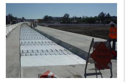
Please note that construction activity is subject to change.