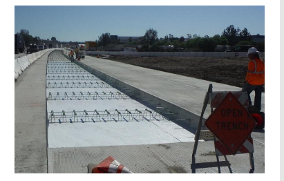
Please note that construction activity is subject to change.