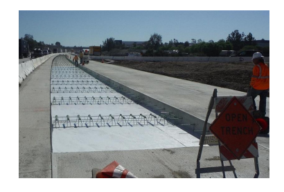
Please note that construction activity is subject to change.