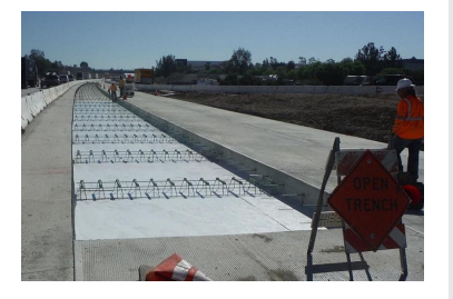
Please note that construction activity is subject to change.