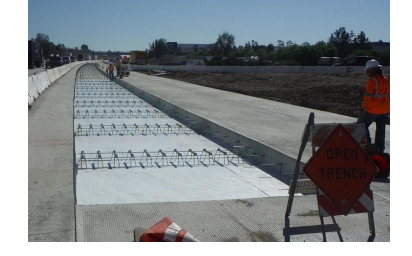
Please note that construction activity is subject to change.