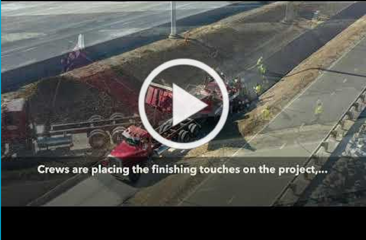
Crews are placing the finishing touches on the project,...