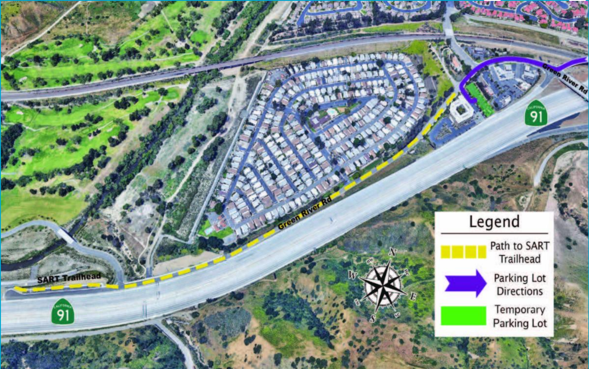
Temporary Santa Ana River Trail Parking Relocation