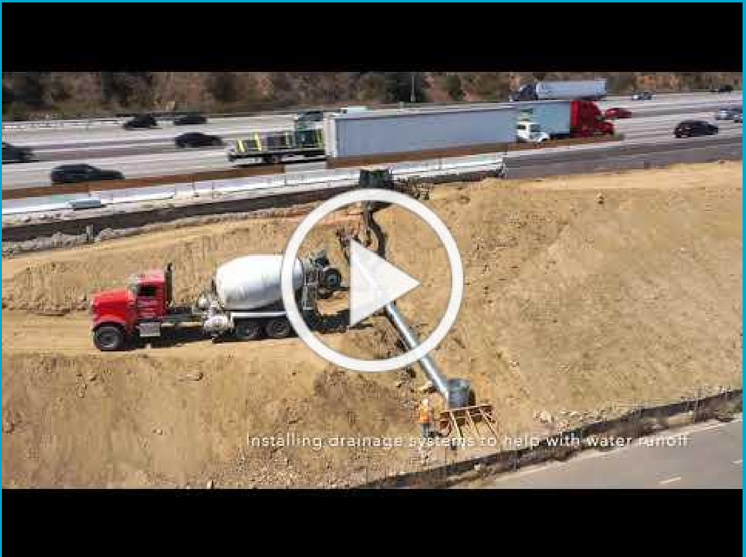
Installing drainage systems to help with water runoff