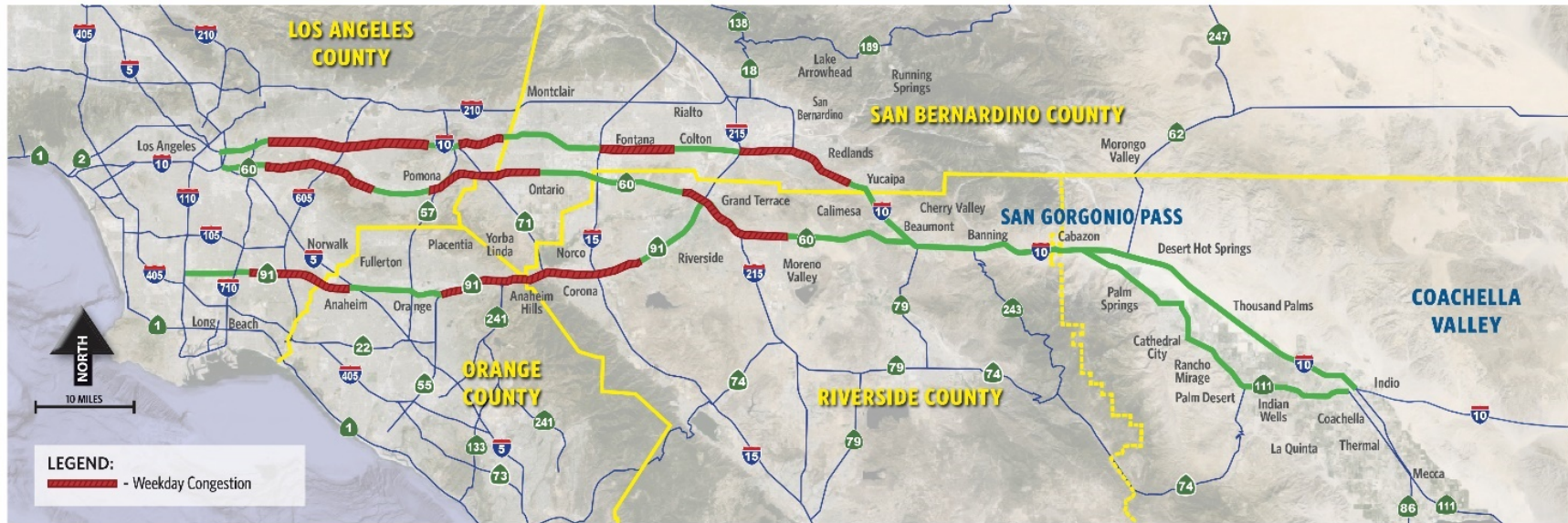
Figure 1-5. Existing Areas of Recurring Weekday Road Congestion within Program Corridor