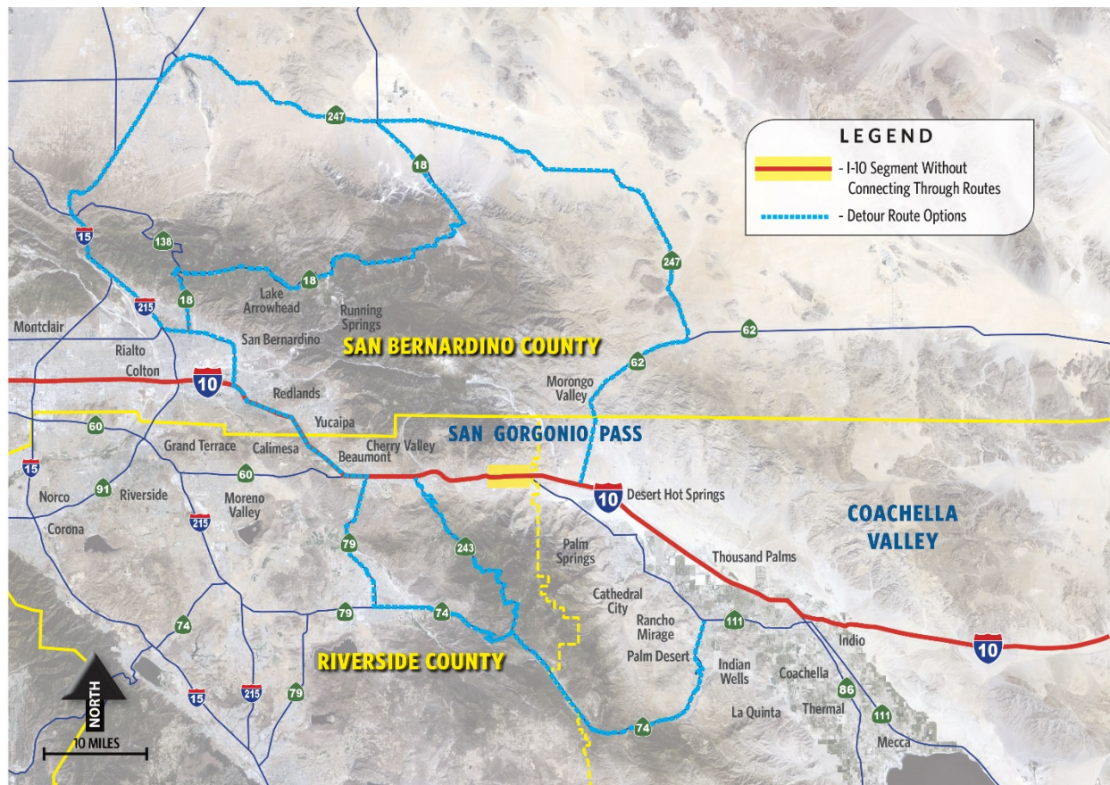
Figure 1-6. Interstate 10 Corridor San Gorgonio Pass Detour Alternatives

Figure 1-6 illustrates the reliance of drivers on I-10 through the San Gorgonio Pass, as no parallel highways exist to I-10 through Beaumont, Banning, and Cabazon; the only alternative routes involve lengthy detours and longer travel times. For example, facing an I-10 closure between Banning and Cabazon, a driver bound for Indio could detour south to SR 74, through the mountains and reach Indio in approximately 2 hours, travelling 80 miles. The direct route via I-10 is typically 46 minutes and 50 miles.