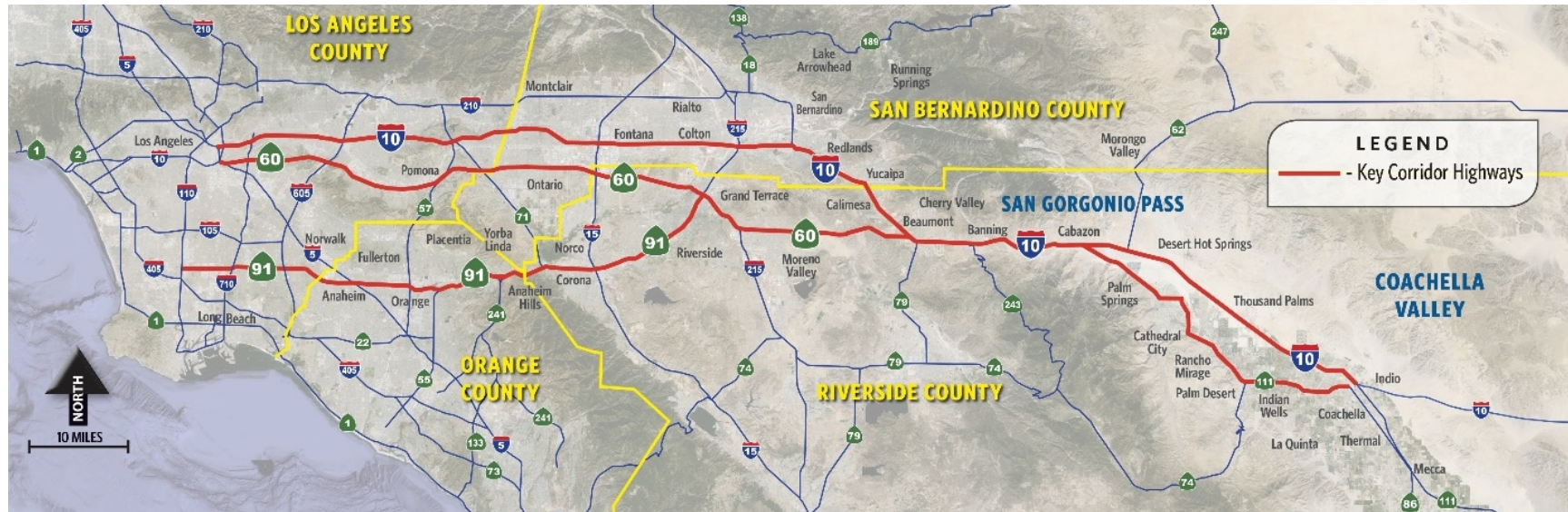
Figure 1-4. Existing Key Program Corridor Highways Connecting the Los Angeles Basin and Coachella Valley