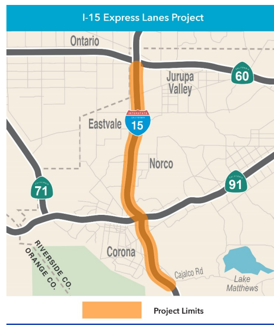
Figure 1: I-15 Express Lanes Project Vicinity Map

The I-15 ELP is part of the Commission's 2009 Measure A Western Riverside County Highway 10-Year Delivery Plan. The project, when opened, results in one to two tolled express lanes in each direction between the I-15/Cajalco Road interchange in Corona and the I-15/State Route 60