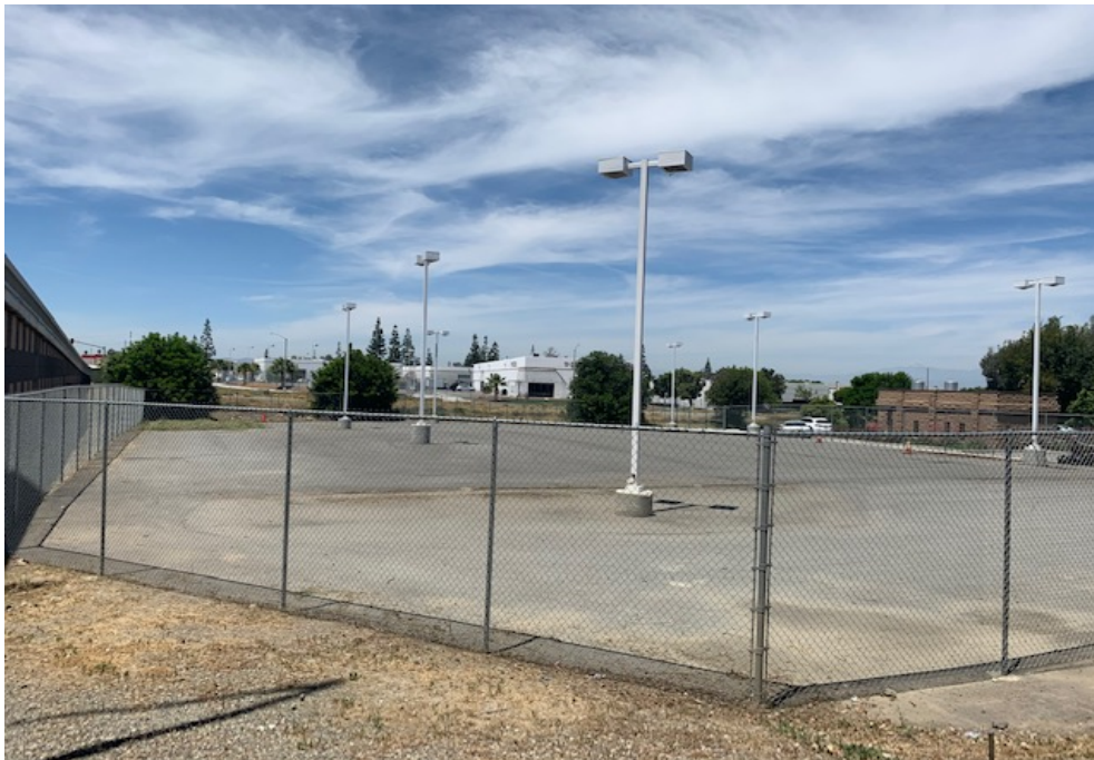
At the south east corner of the parcel looking west.