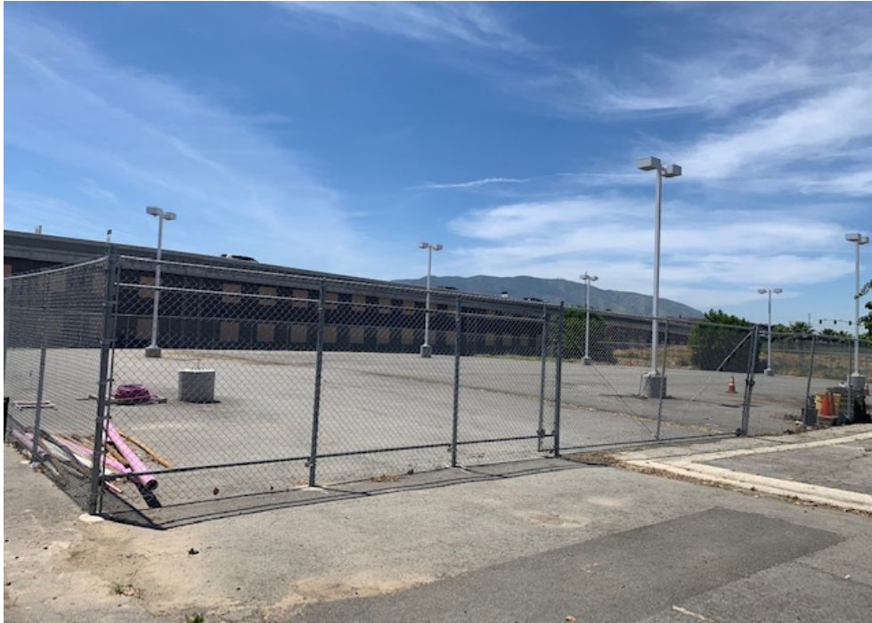
At the north east corner of the parcel looking southwest.