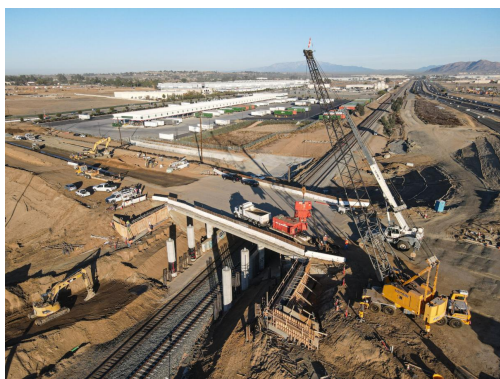
Bridge widening activities at the railroad tracks.