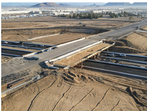
Progress of support structure for bridge widening over I-215.