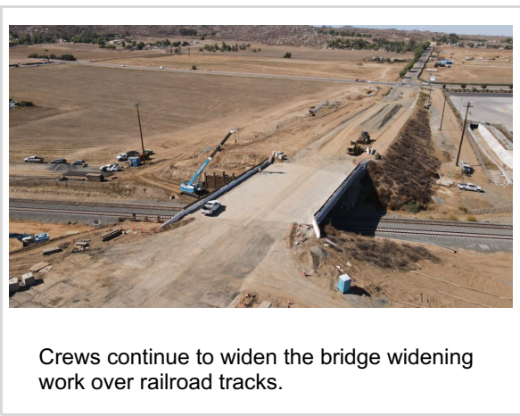
Crews continue to widen the bridge widening work over railroad tracks.