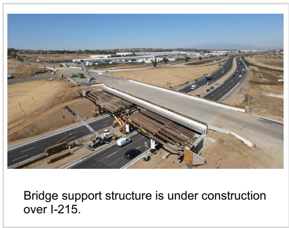
Bridge support structure is under construction over I-215.