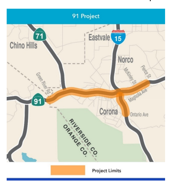
Figure 1: SR-91 CIP Vicinity Map

The SR-91 CIP (see Figure 1 Vicinity Map) was completed in 2017. The design-build contract included a two-year warranty period and three years of plant establishment for landscaping and habitat restoration. Inclusion of warranty requirements as part of a design-build contract is beneficial as the warranty requirements serve as an incentive for both design and construction quality. AWJV continues under contract with the Commission to perform this work.