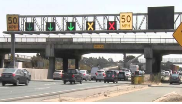
Example of lane control sign from Contra Costa County, CA