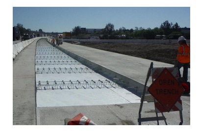
Please note that construction activity is subject to change.