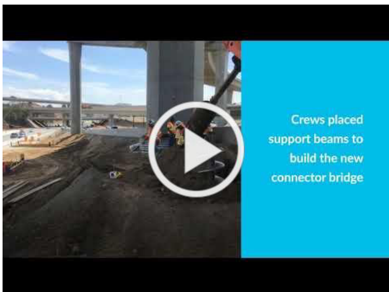
Crews placed support beams to build the new connector bridge