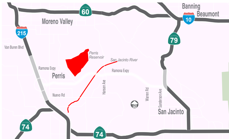
RCTC Project Limits