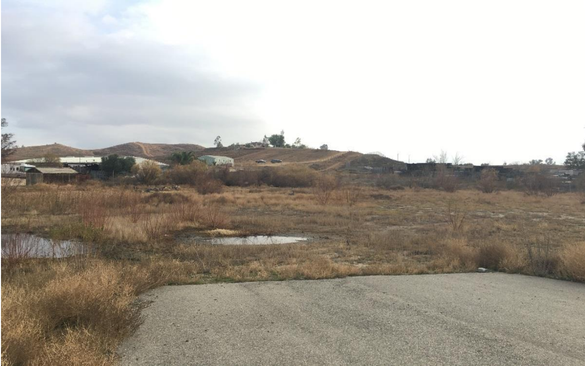
Southeasterly view of subject along SR-74