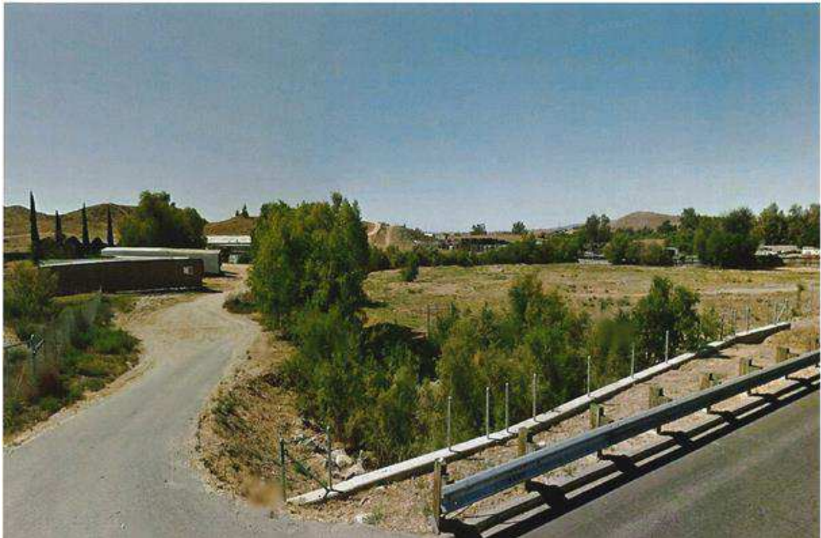
Southerly view of subject along SR-74