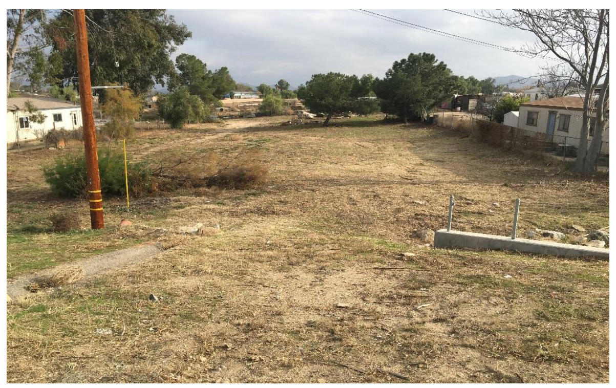
Southeasterly view of subject along SR-74