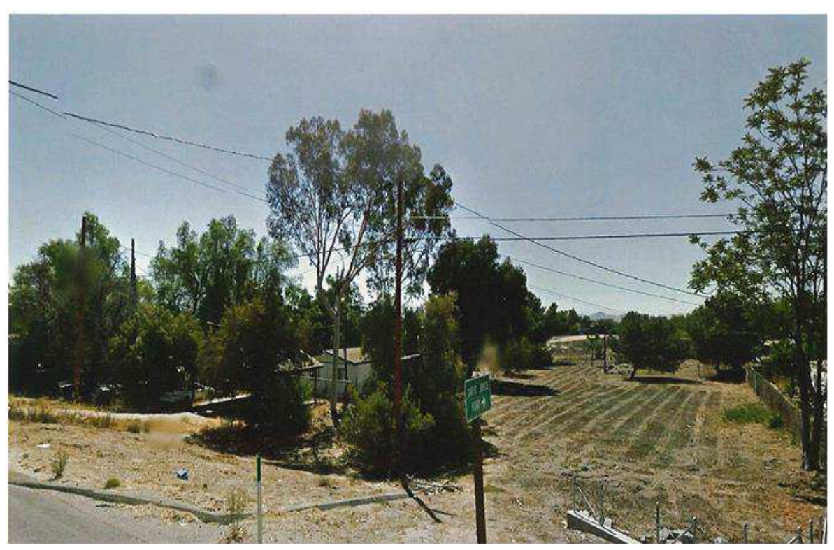
Southeasterly view of subject down the Southwesterly boundary along SR-74