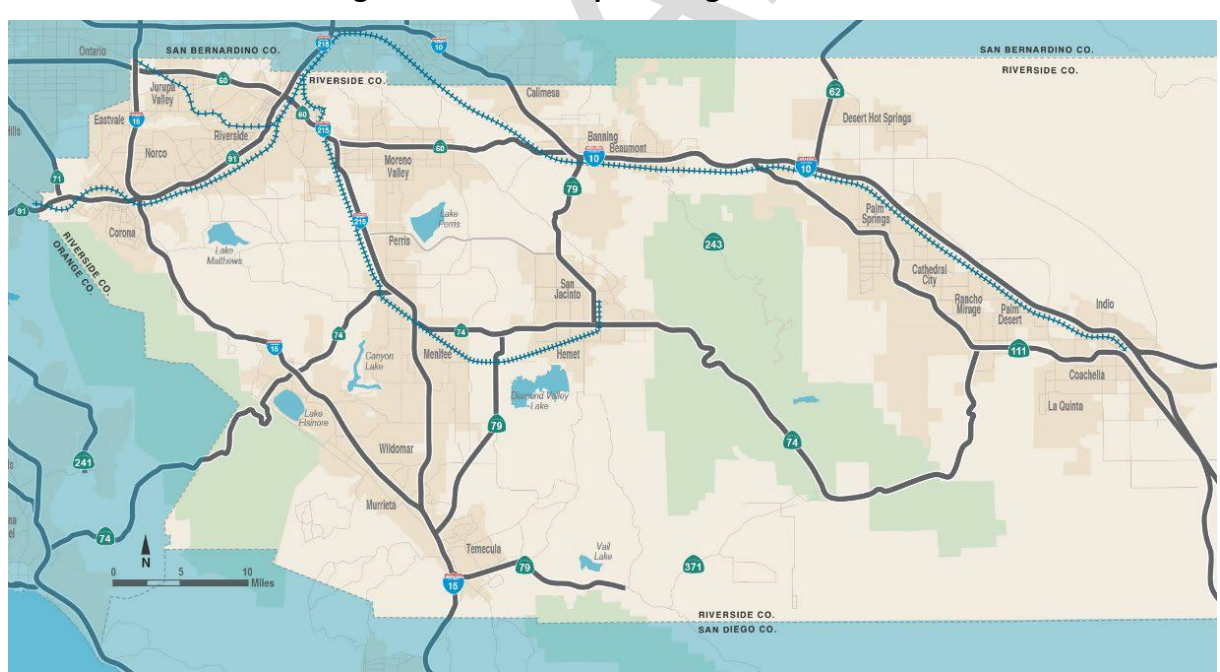
Figure X – RCTC Vanpool Program Service Area

Under the Program, Contractors will lease Vehicles directly to qualified individual Program applicants. An individual qualified to participate in the Program, and who enters into a lease with the Contractor, is referred to herein as the "Coordinator." If more than one Contractor is selected, RCTC will provide to Coordinators a list of available Contractors, and the individual Program applicant, and not RCTC, will select the Contractor to utilize for lease of a Vehicle.