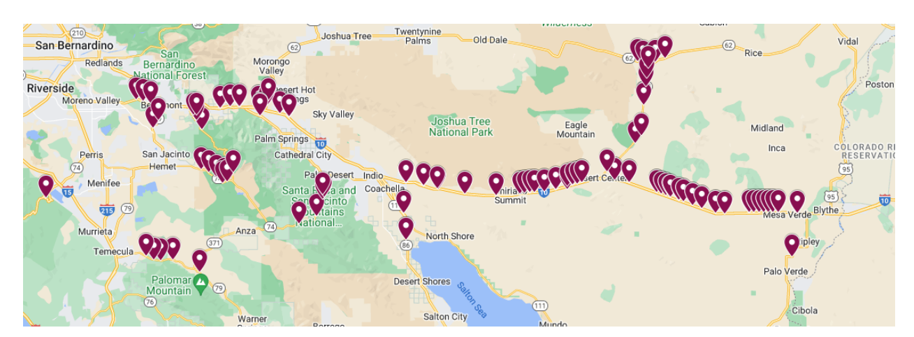
Figure 1. Current Call Box Locations

By 2024, only 136 call boxes remain, primarily in rural highway segments in eastern Riverside County. These call boxes now account for just over 300 calls annually, with operating costs exceeding $82,000 for FY24.