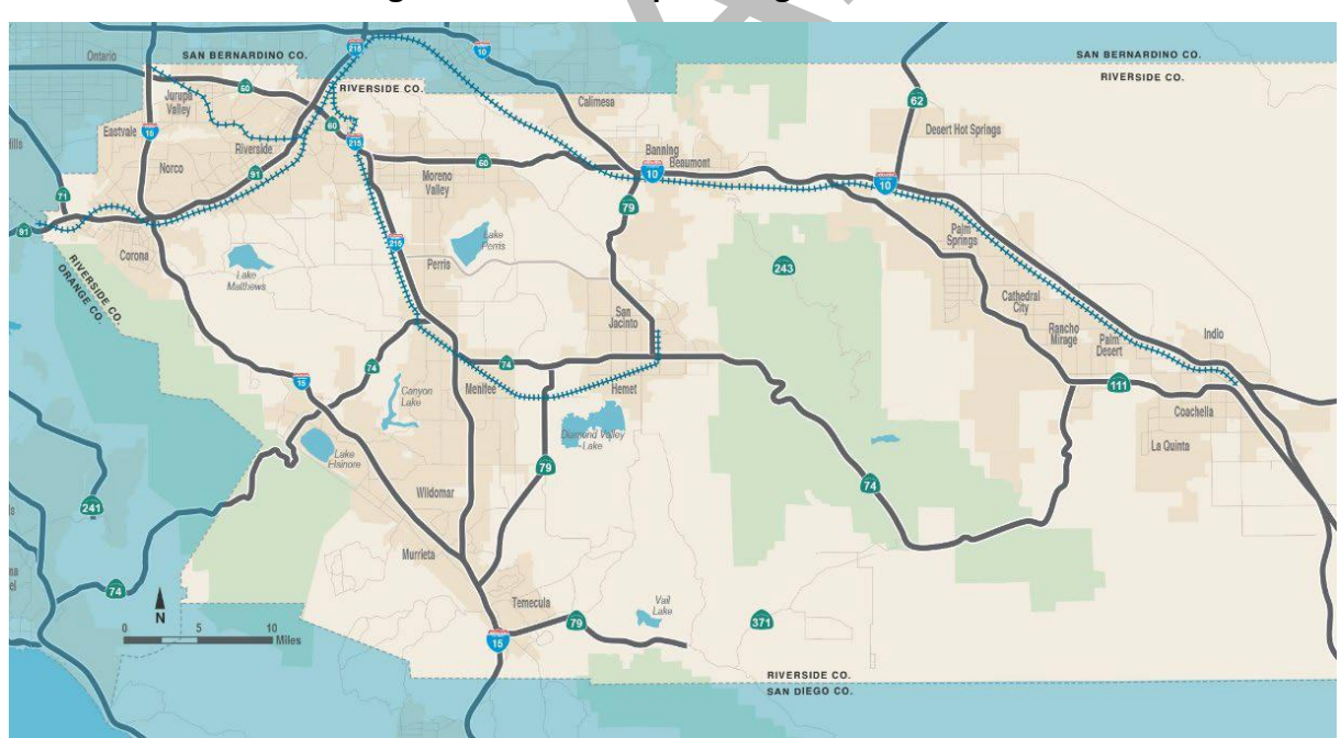
Figure X – RCTC Vanpool Program Service Area

Under the Program, Contractors will lease Vehicles directly to qualified individual Program applicants. An individual qualified to participate in the Program, and who enters into a lease with the Contractor, is referred to herein as the "Coordinator." If more than one Contractor is selected, RCTC will provide to Coordinators a list of available Contractors, and the individual Program applicant, and not RCTC, will select the Contractor to utilize for lease of a Vehicle.