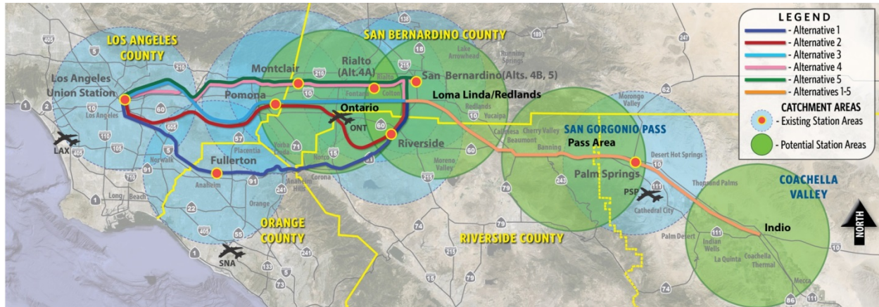
Figure ES-3. Coachella Valley – San Gorgonio Pass Rail Corridor Route Alternatives

Route Alternatives 1 through 3 use the UP Yuma Subdivision between Indio and Colton and then follow three of the four rail lines west of Colton, as described below.