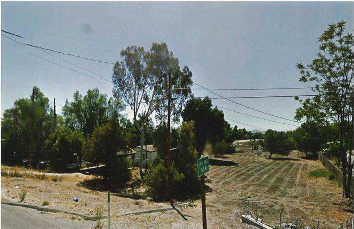
Southeasterly view of subject down the Southwesterly boundary along SR-74