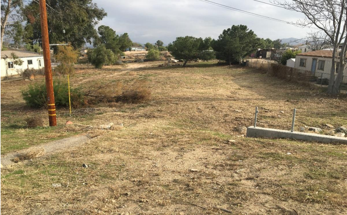
Southeasterly view of subject along SR-74