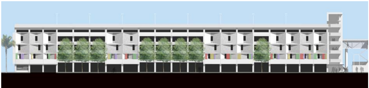
Architectural rendering of the completed parking structure.